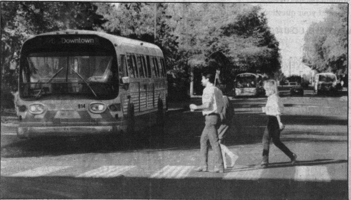
Cheaper buses may be coming our way.

Representatives from the U of A's bus pass campaign will be visiting classes, clubs, residences, and fraternities to inform students about the campaign.