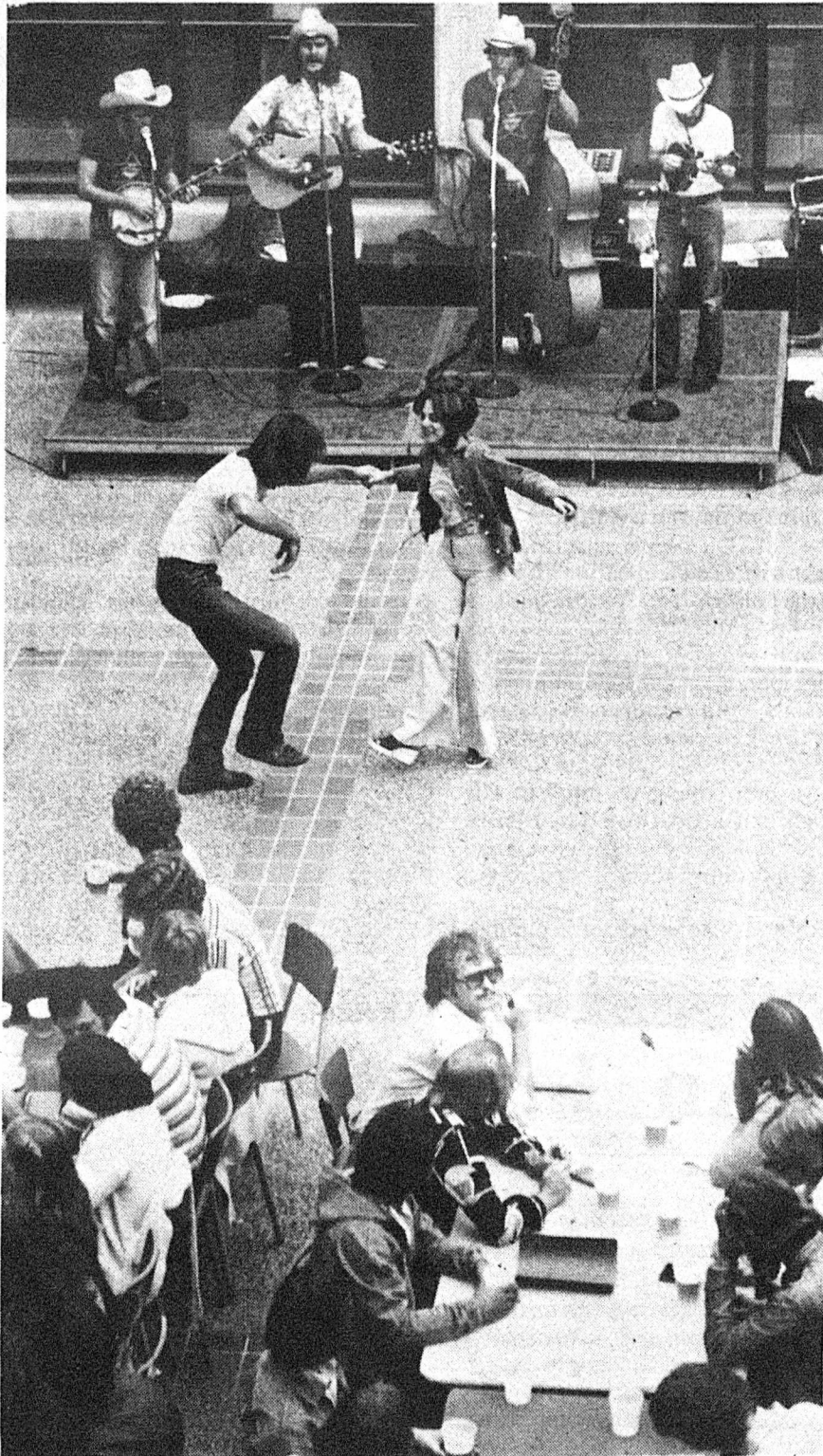
Bluegrass and beer... Nobody disco'd down to SUB during Freshman Introduction Week, but a few people jigged and a lot chugged.