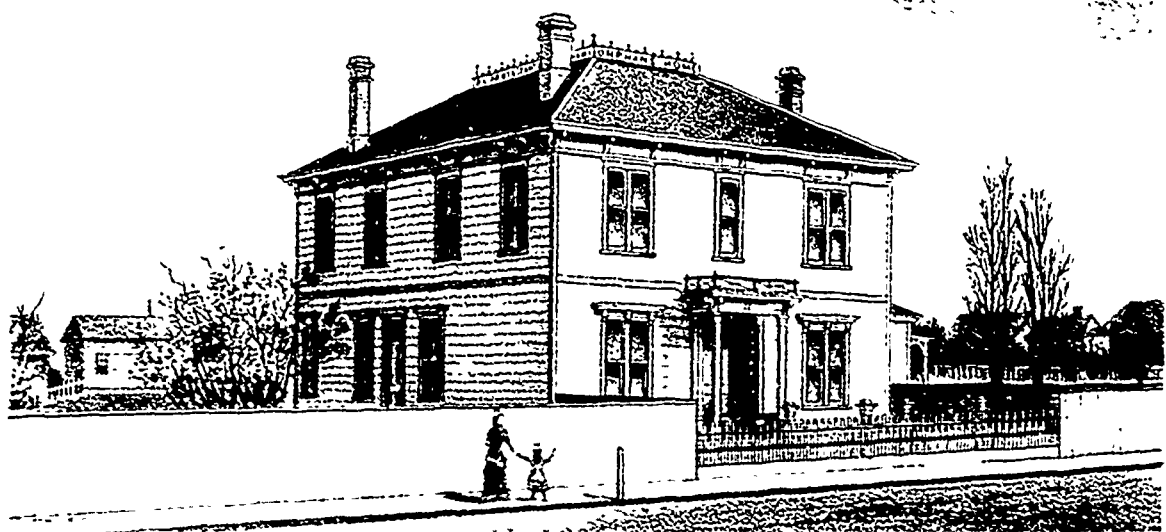
NEW PROTESTANT ORPHANS' HOME