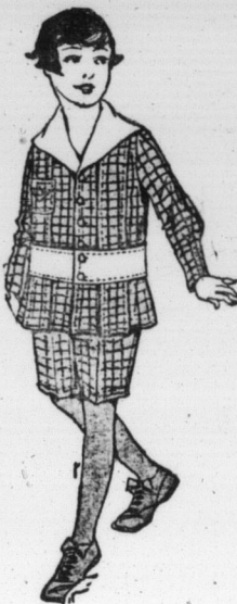
This is a very good suit for the small boy. McCall Pattern No. 7608, Boy's Suit. In 4 sizes, 2 to 9 years. Price, 15 cents.