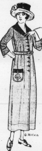
A simple dress, requiring very little material indeed! McCall Pattern No. 8227, Ladies' One-Piece Dress. In 6 sizes, 34 to 44 bust. Price, 20 cents.

These patterns may be obtained from your local McCall dealer, or from the McCall Co., 70 Bond St., Toronto, Dept. W.