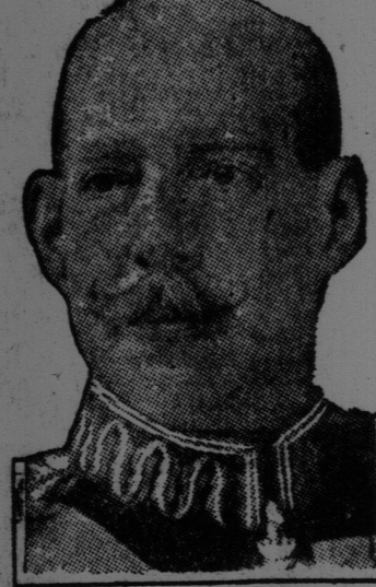
King Constantine of Greece, who will know soon by plebiscite of the people whether or not he will again occupy the throne.