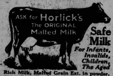
ASK for Horlick's THE ORIGINAL Malted Milk Safe Milk For Infants, Invalids, Children, The Aged Rich Milk, Malted Grain Eat in powder. Digestible—No Cooking. A Light Lunch