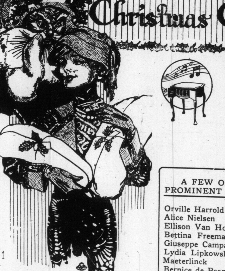
OPEN EVENINGS UNTIL XMAS

WALT. DICKSON, Photographer 238 QUEEN ST. EAST Near Sherbourne