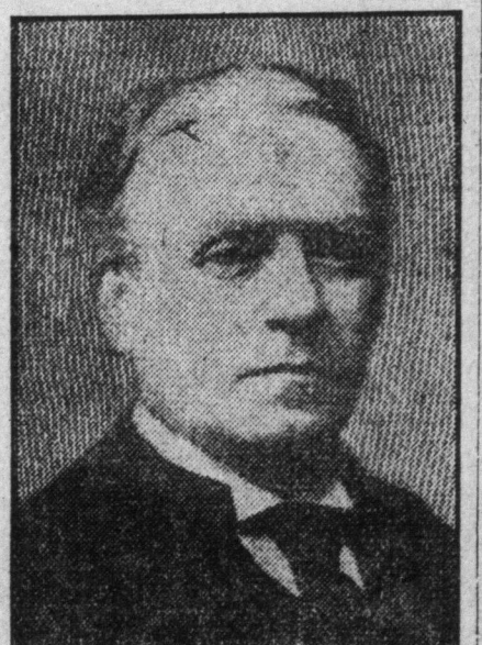
amongst the number at the annual Leader of British Parliament which was opened yesterday.