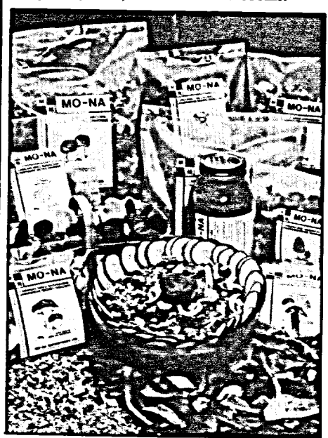
Dehyrated, fresh, and brined mushrooms.

Cavendish Farms: frozen potato products; green peas, other vegetable and fruit items Coorsh Division, Multifoods Inc.: wieners Dover Mills Ltd.: bakery flour; family flour; millfeeds