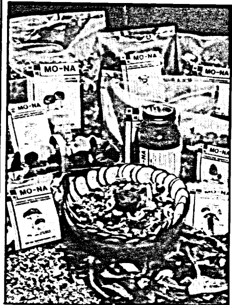
Dehydrated, fresh, and brined mushrooms.

Dover Mills Ltd.: bakery flour; family flour; millfeeds