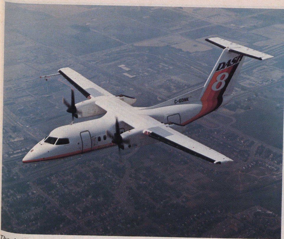
The de Havilland DASH 8 is Canada's latest transport plane.

tion inertial navigation systems based on a ring laser gyroscope; — Garrett Manufacturing's peripheral vision horizon device; and