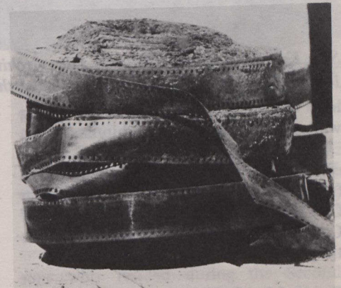
Sample of unearthed films, Dawson City, Yukon, August 1978.

Of particular interest to the Archives are the newsfilms — produced during the