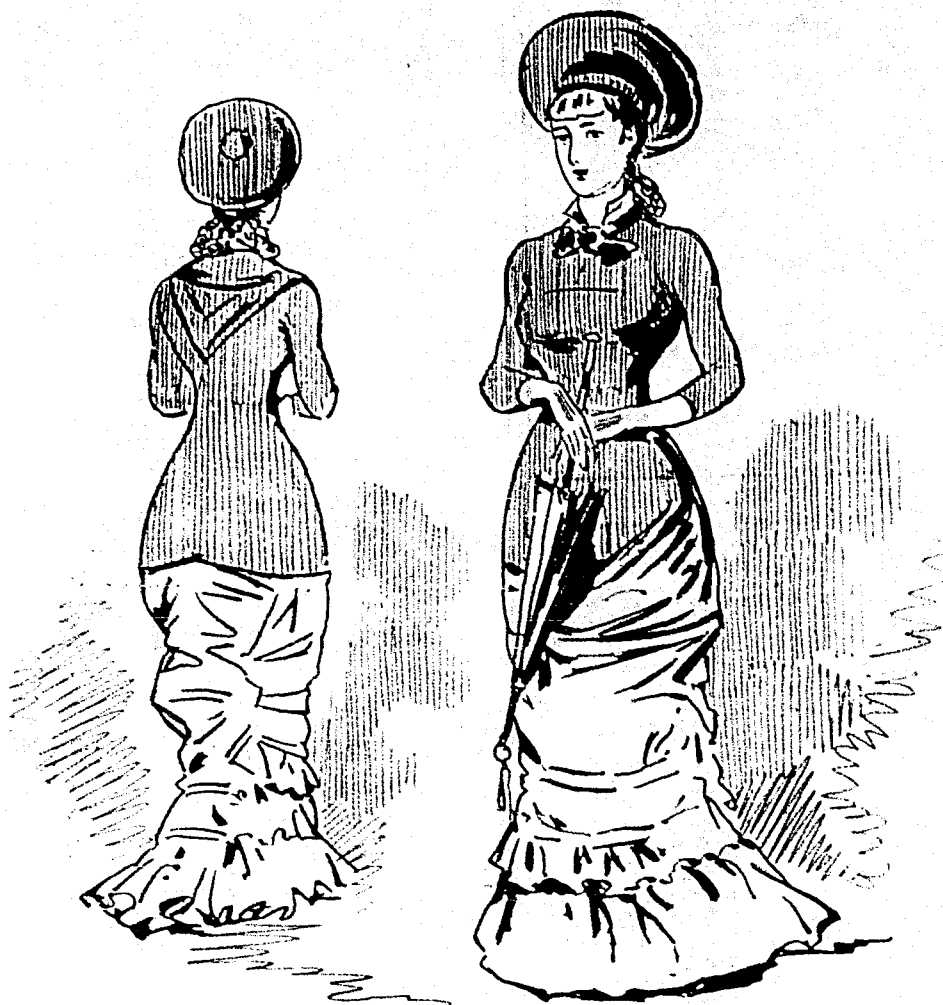
A LA MODE.

RAND McNALLY'S MAP OF ONTARIO, WITH Index, accurately locating on the Map Counties, Islands, Lakes, Rivers, Post Offices, Railroad Stations, and all Towns, &c. Paper, 40c; cloth, 60c., mailed. CLOCHER BROS., Booksellers, Toronto.