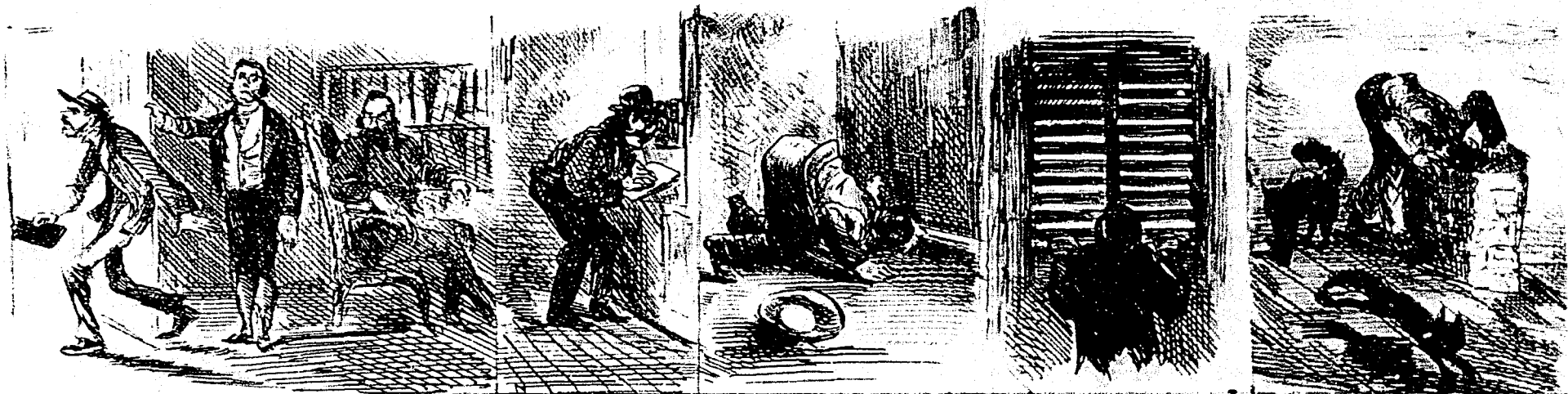
5. He next enters the office of the Hon. Mr. — but instead of gaining the desired information he is shewn out by the Messenger. 6. He tries another expedient but is unsuccessful. 7. Ditto, Ditto. 8. Ditto, Ditto, again. 9. If he has succeeded this time, the fact will be duly chronicled.

WANTED.—TEN RESPECTABLE YOUNG MEN and Three YOUNG LADIES. to qualify as Telegraph Operators. For particulars see advertisement of Dominion Telegraph Institute. Terms: $30.00 for the full course, including use of Instruments and Line. Apply at the Dominion Telegraph Institute, 89, St. James Street, Montreal. Also, at the offices of the C. J. News, Hearsthouse and L'Opinion Publique , No. 1, Place d'Armes Hill. 4-11f