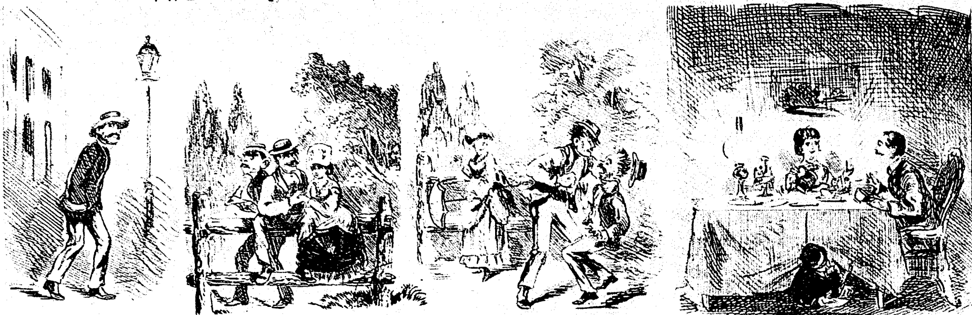
1. He starts on his rounds. 2. Overhears an interesting couple and begins to take notes. 3. Is discovered and rewarded accordingly. 4. Gets under one of the tables in the dining room of the Hotel and makes a rich harvest of gossip.