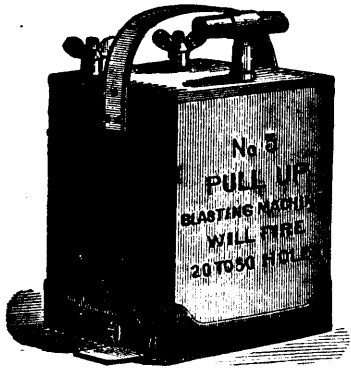
SEND FOR CATALOGUE.