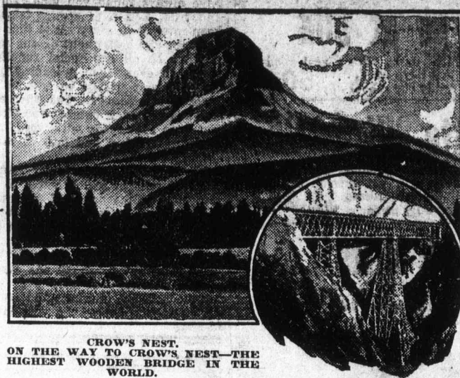
CROW'S NEST. ON THE WAY TO CROW'S NEST—THE HIGHEST WOODEN BRIDGE IN THE WORLD.

Rolling up to the Crow's Nest Pass are olive green foothills without a tree upon them—natural cattle runs clothed with succulent short grass. Here are seen occasional outcrops of rock, which in their four or five feet of height show all the characteristics of a mountain range; miniatures of the Rockies, with crag and precipice and col reproduced on the smallest scale. With a bag of salt one could lay on glaciers, touch the peaks with white and have a toy range which any Eastern schoolteacher could set up in her classroom with advantage to herself and her pupils. Canadians east of Medicine Hat know too little about the construction of this Continent and about the glorious engineering of Nature.