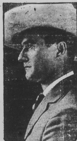
TOM MIX DIRECTION WILLIAM FOX