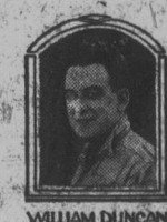
WILLIAM DUNCAN VITAGRAPH