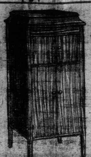
STYLE 150 A In Mahogany, Walnut, Oak PRICE $150.00

91 St. Paul Street St. Catharines, Ont. Phone 41