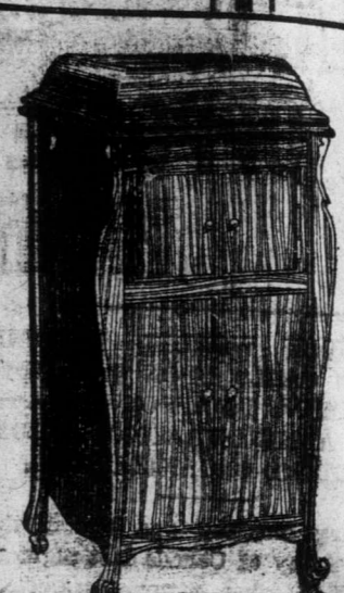
STYLE 200 A In Mahogany and Oak PRICE $200.00

AS A superb Christmas present, get a MASON & RISCH PHONOGRAPH and a collection of Victor Records. Together they represent the highest point that can be reached in the reproduction of musical tones