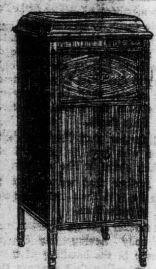
STYLE 250 A In Mahogany, Walnut, Oak PRICE $250.00