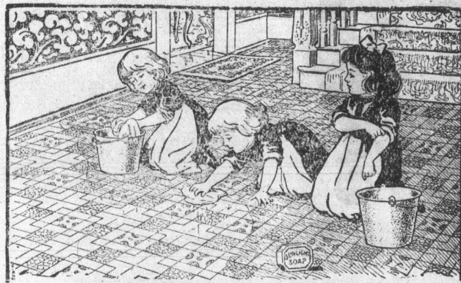
Sunlight Soap freshens and preserves Linoleums and Oilcloths.

I was told if a bump was well buttered the skin would not turn black and blue. I had little faith in the remedy, but happened to try it and found that no mark was left. Butter is always within reach and my little ones have been saved many ugly looking marks.—M. S.