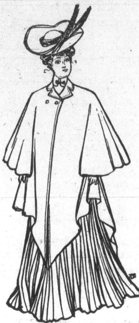
A USEFUL CLOAK.

The ordinary cloak can hardly lay claim to be considered a thing of beauty. It is a covering from dust and dirt or lends additional warmth and protection from drafts or rain, but is strictly utilitarian; also, as a rule, it is absolutely out of the question