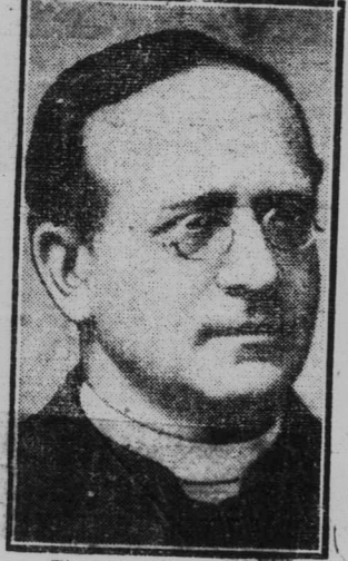
The New Pope, Pius XI. Cardinal Ratti, Archbishop of Milan, who was elected Pope on the seventh ballot of the Sacred College. He was only created a Cardinal last June, and is in his 65th year.

Victoria, B.C.—One would expect that with the exception of a slight temporary inconvenience to pedestrians and autoists until they become accustomed to the new regulations, the changing of the rule of the road, from left to right, would have little effect. It has, however, occasioned quite a flutter in real estate and stores car corners are now wait-for-the-rent. Some are frank enough to acknowledge an increase in business since the new rule came into effect.