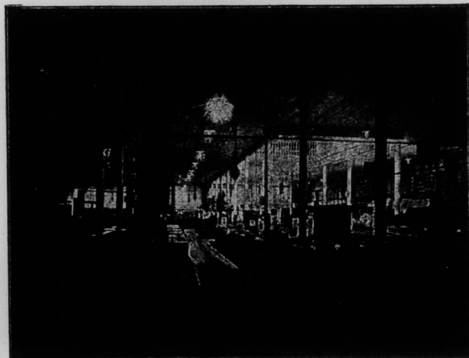
EATON'S—WITH PLATE GLASS.