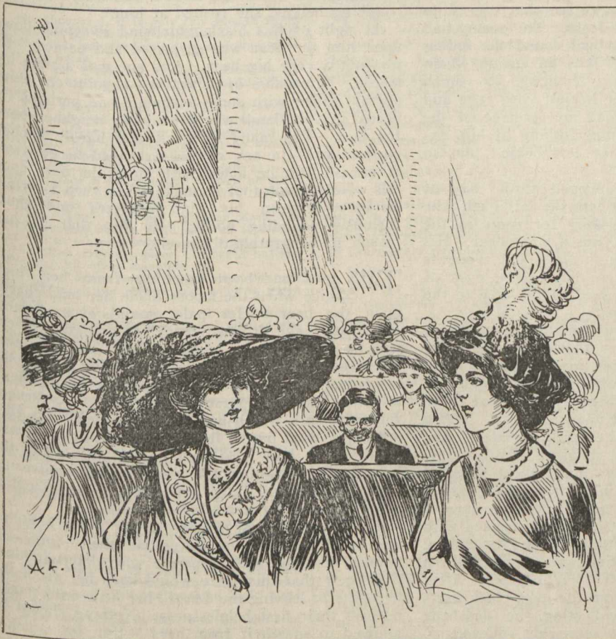
The Man in Church on Easter Morning.