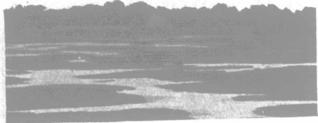
Part of Trinidad Asphalt Lake

The costliest roofings are the roofings that don't last.