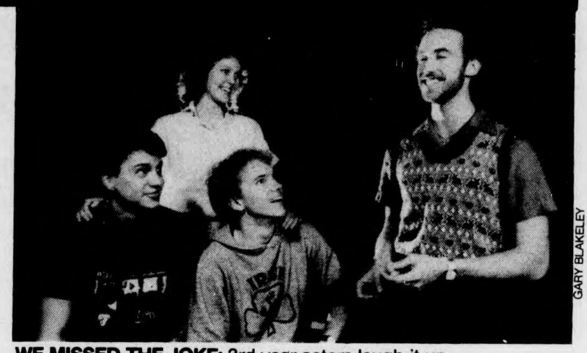
WE MISSED THE JOKE: 3rd year actors laugh it up.

The performances are all "productions in process" and as such they become a test of the actors at their craft