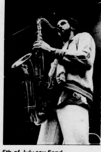
5th of July sax fiend.

Supermale is scheduled to play at Theatre Passe Muraille until November 10th. The show has witnessed full houses since it opened Halloween night. Hopefully, its run will be extended for at least another week. Supermale is a must for anyone in the least or most bit interested in theatre, Surrealism, or pataphysics in general and specific. "There there."