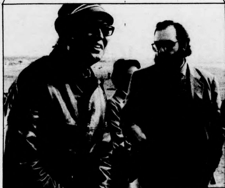
Kurosawa and Li'l Francis Coppola talk shop.