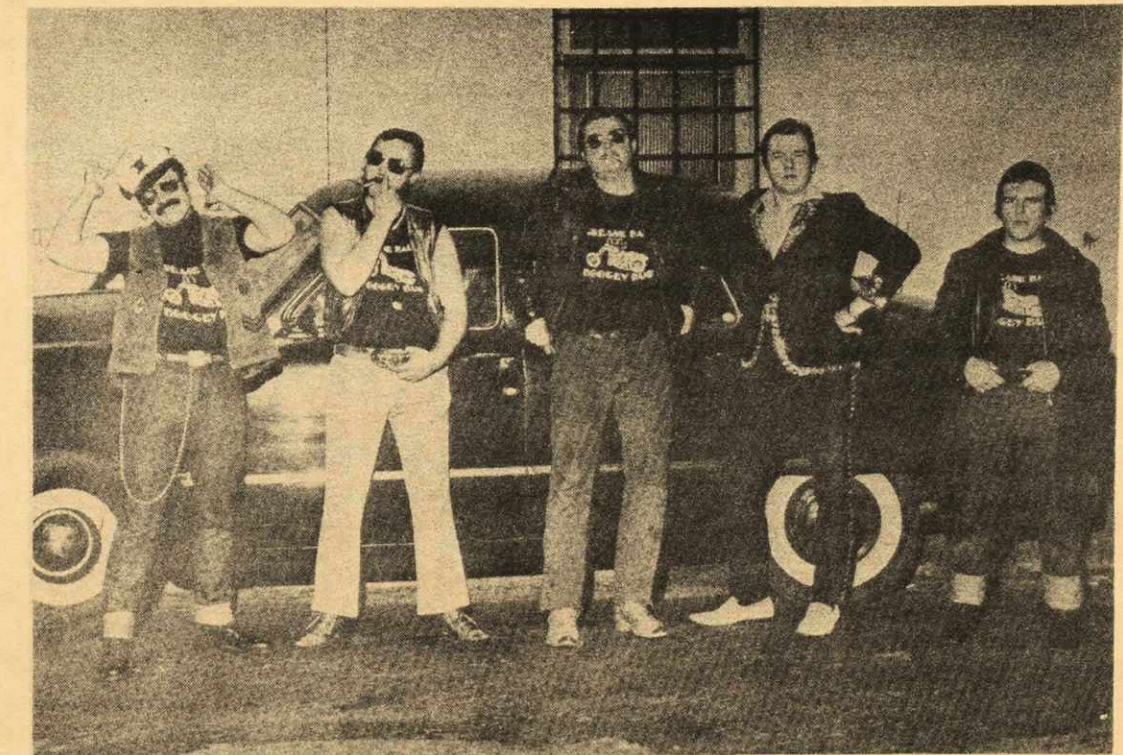
Grease Ball Boogie Band Wed., Sept. 12, Halifax Forum

In this age of war, strife, famine and Clerasil, it warms the heart to know that there survive five fossils from the fabulous fifties. Yes, Betty Lou, there really is a Grease Ball Boogie Band. They are as authentic as chips and gravy; as old as white socks and