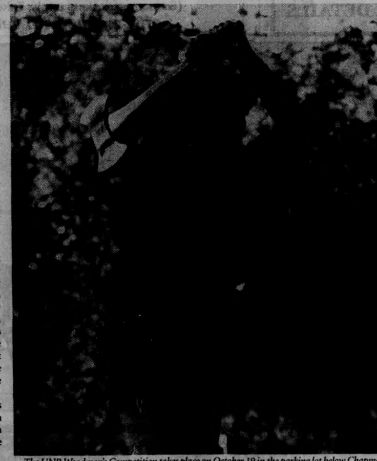
The UNB Woodmen's Competition takes place on October 19 in the parking lot below Chapman Field. Pictured above is a member of the UNB team practicing his art.