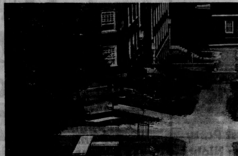
Responsibilities of Grad Class include choosing, promoting and fund-raising for an annual Grad Class Project. Last year, over $10,000 was raised to install two benches and lampposts in the main square in front of Harrison and Bridges residences.