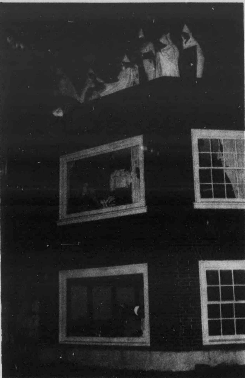
Down it goes: The great pumpkin is sacrificed once again.