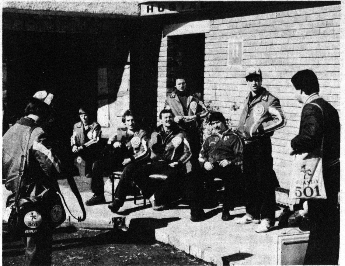
It seems like half the time in Spain was spent riding a bus...or waiting for one. Here some of the players relax in the sun in front of the hotel. Brandy 501 was one of the Games' sponsors.