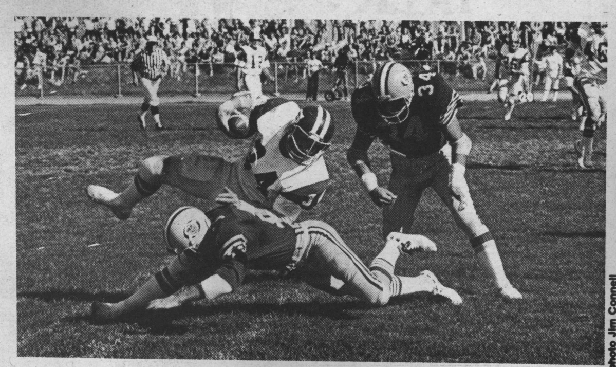
Bear defense was flexible, but Kokotilo and teamate show that it's not easily broken.

Quarterback Forrest Kennerd didn't play his best game but still passed for two touchdowns and 237 yards. The running game, meanwhile, was effectively stopped by the Huskies, gaining only 69 yards. The offensive line again played quite well, especially in pass protection. Offensive tackle Ted Hole offered these comments on the offensive line: "Our pass protection was really good. The main reason is that we are