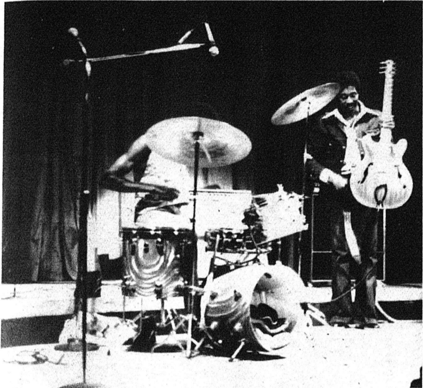
Buddy Guy and Junior Wells, prominent figures in the blues music scene, played to a crowded house in the Student Union Theatre last Wednesday.