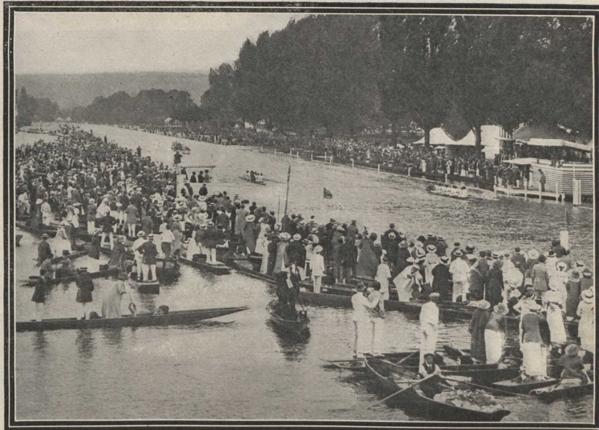
And in the Grand Challenge on July 3rd, the Leander Crew Beat the Canadian Argonauts by a Length.