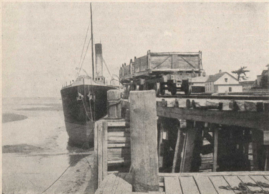
Low Water at Windsor, N.S.—The Avon River