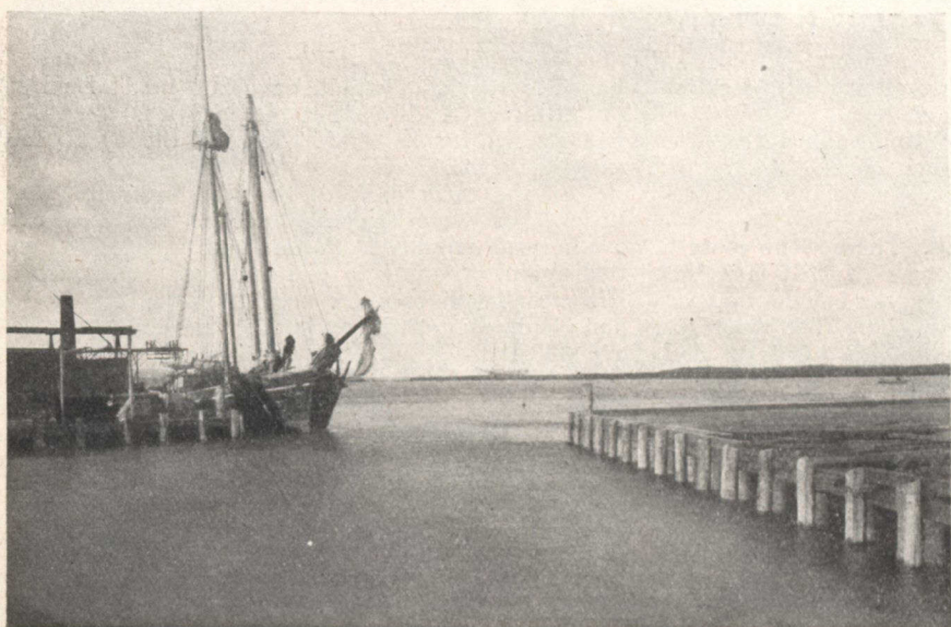
Wolfville Harbour at High Water