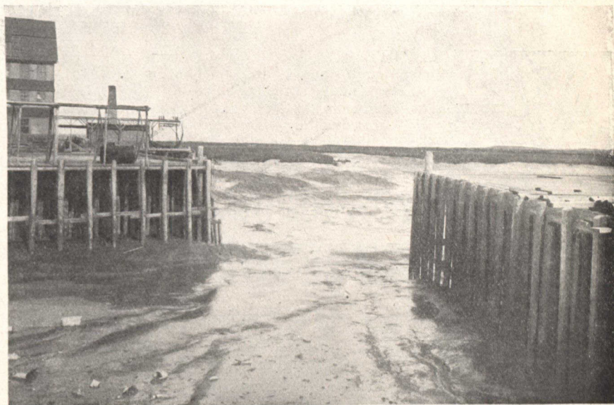
Wolfville Harbour at Low Water