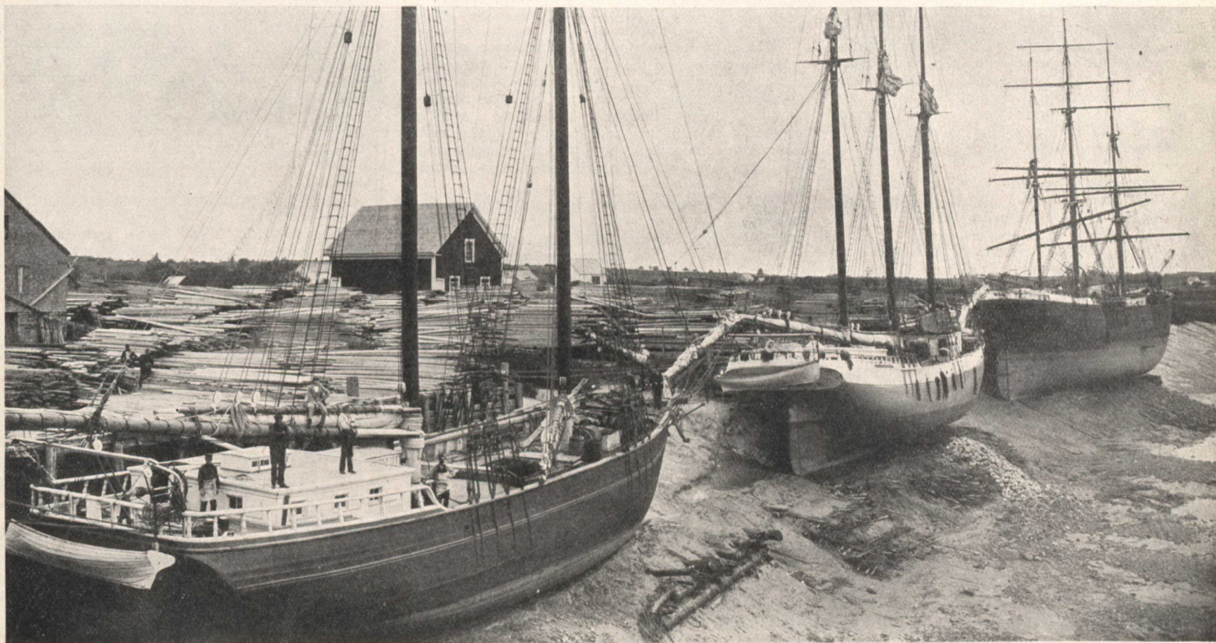
Low Water at Port William, N.S.—The Schooners are resting on the River Bottom