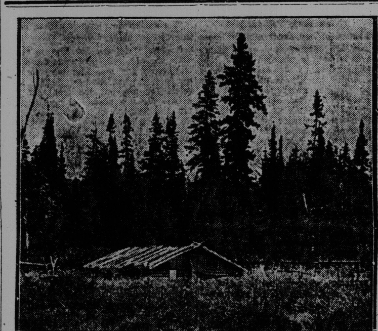
A typical trapper's cabin in a picturesque part of northern Quebec near James Bay. This photo was taken

HALF PRICE TO CLOSE OUT. Never again reash down and $5.00 monthly. Close to Red Head Road and street cars; water, electric lights, 'phone. They are going rapidly, COURTENAY BAY HEIGHTS FAWCETT'S STORE, East St. John. 5-26-28-30 'Phone M. 4652