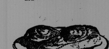
Many kinds of Raisin Rolls—fresh and tempting!