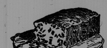
Raisin Pound Cake—rich with fruity goodness