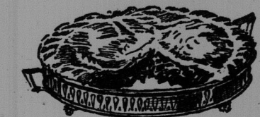
California table grapes and California sunshines in a pie!

Your Baker Endorsed by bakers everywhere, and by the Bread and Cake Bakers' Association of Canada