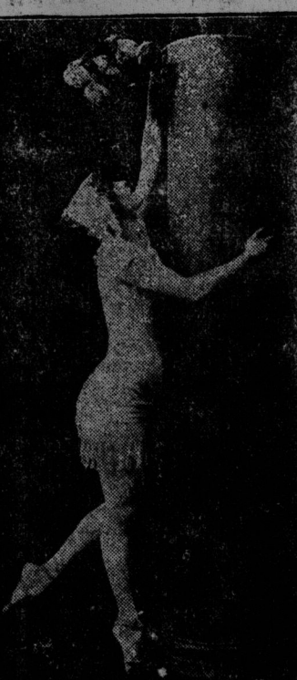
Annette Kellerman, the most perfect swimmer in the world, soon to be seen at the Opera House in the famous photo drama, "Neptune's Daughter."