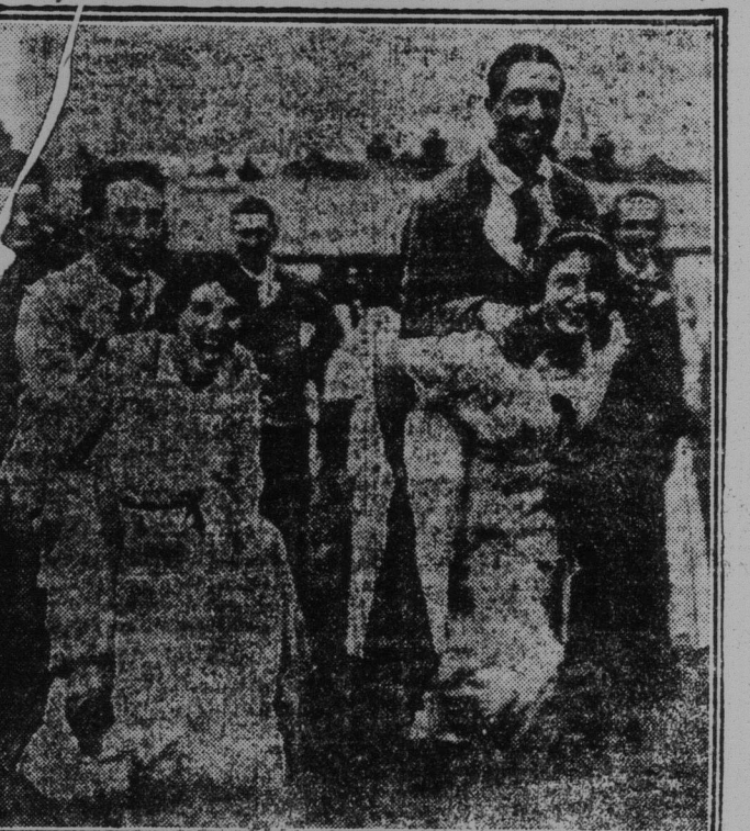
Women munition workers' sports at Slades Green, England. Photo shows a unique pick-a-back race. All enjoyed themselves.