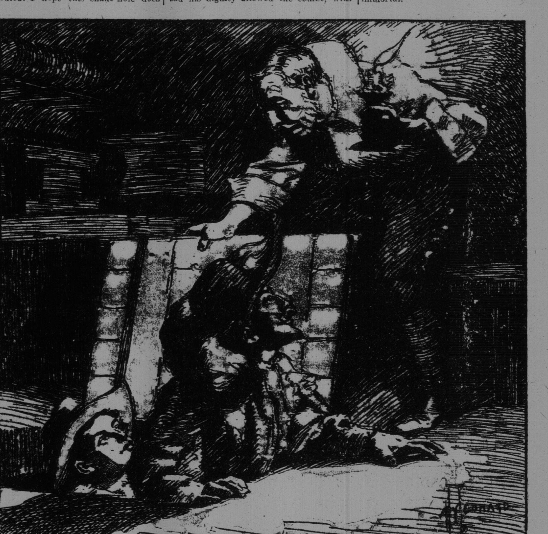
"He looked at us somewhat troubled or alarmed."