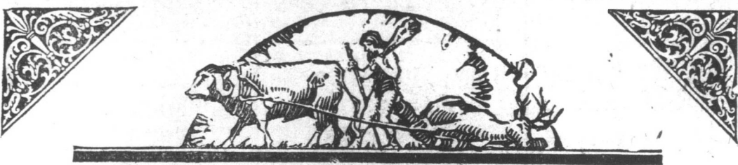
The Earliest Vehicle - The Sledge

Girls' New Spring Coats, that fit girls eight to fourteen years, are sell- ing at AYRE & SONS in their Mantle Rooms, for Ten Dollars and Twenty Cents.