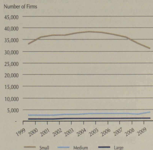
Number of Exporters, by Firm Size, 1999-2009

Source: Statistics Canada, Exporter Register.