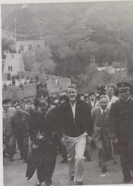
Mr. and Mrs. Mulroney on China's great wall.

At a special ceremony on May 10, Mrs. Mila Mulroney presented a cheque