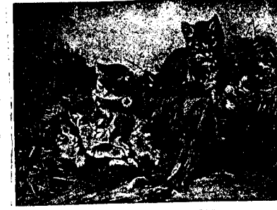
A KITTEN FAMILY.

Size, 17 x 18 in. One of 33 studies to be given in a $4 subscription. To be published April 25, 1891. For sale by newsdealers.