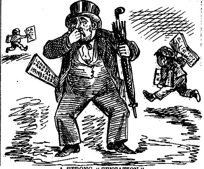
A STRONG "SENSATION."

Bookseller.—Why should I have to shut my shop while you allow that [He forgets that he has a copy of the London Free Press, Handford edition, in his pocket.]