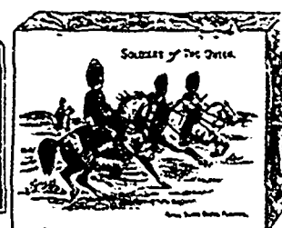
"Royal Scots Greys"—9113.