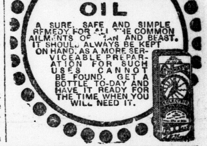
DR. THOMAS' ECLECTRIC OIL

The belt may be a narrow one of the narrow ribbon or may be a cord matching in color one of the tones of the ribbon.