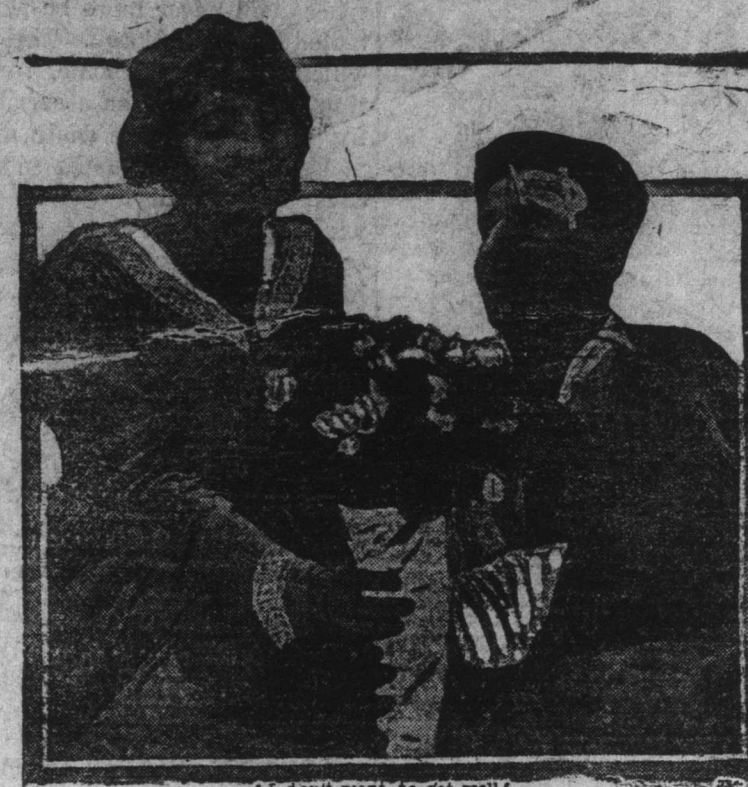
"I don't want to get well!" FRED STONE in "The Goat."

SPECIAL:—Don't fail to see the big Xmas picture "COMRADE SHIP," which will be screened on Christmas Eve and Day.