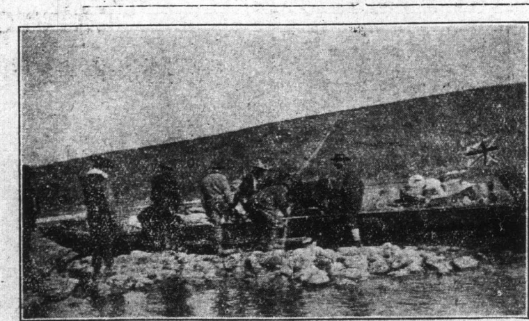
ing. The picture shows the first two horses to go over the Big Cascade Rapids, near Fort McMurray, on board a scow.