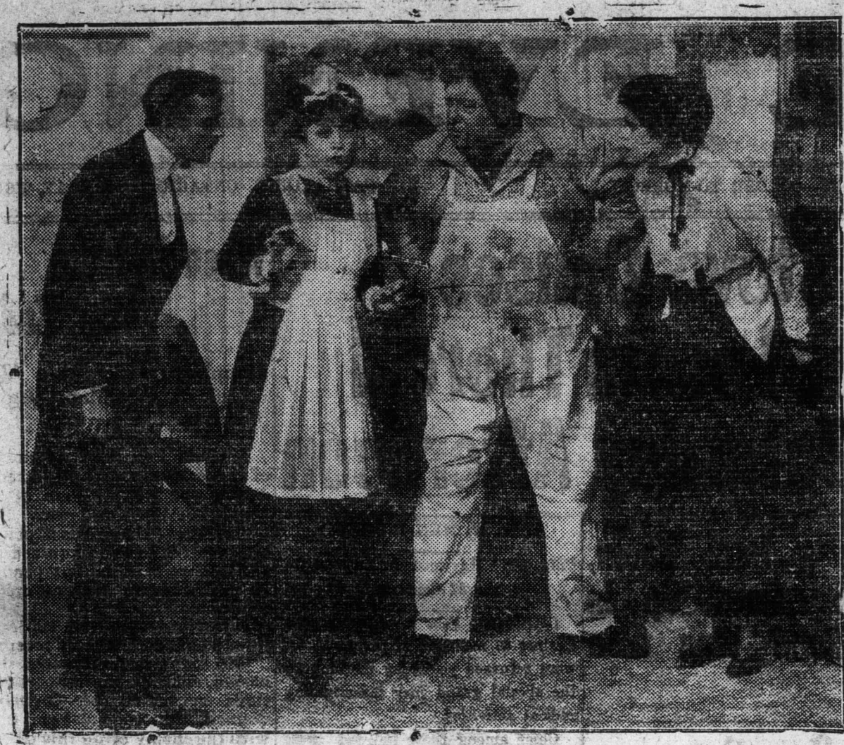
Scene from the Laugh Festival, "Fair and Warmer," at the Grand Ope to House, Thursday night Feb. 5th.

OTTAWA, Jan. 29 .- The Canadian lovernment will contribute toward the relief of Austria, but Sir George oster stated yesterday that the mount of the contribution had not of any kind. If it's to be moved send yet been determined. Washington despatches state that Canadas contribution is five million dollars, but the Government has not yet decided.