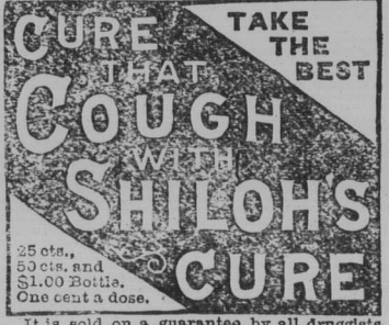
It is sold on a guarantee by all druggists. t cures Incipient Consumption and is that the Cough and Croup Cure.

East Buffalo, April 26.—Receipts of fattle were more liberal to-day of through stock, but light of stock; efferings of latter were 'peddled out at full stong prices; good fat cows sold at $4 ind sche old but fat course lots brought $3 50 to $3 85; veals were in moderate supply, and brought $3 75 to $4 25, with extra at $4 50 to $4 75. Hogs-Receipts moderate, 2,500 head; the market was active and higher for all grades; neediums, heavy, and choice Yorkers sold at $5 20 to $5 35, roughs, $4 25 to $4 50; stags, $3 25 to $4 25. Sheep and lambs-Offerings fairly libcral, 36 cars; the market was active and higher for all grades of good stock, but fat and heavy ewes sold no better; top wethers brought $4 50 to $4 05; fair to good mixed sheep, $4 15 to $4 60; fair to good mixed sheep, $4 15 to $4 65; $2 to $2 75; fancy heavy lambs, $5 50 to $5 60; fair to good, $4 90 to $5 60; spring lambs, common to choice, $3 50 to $9.