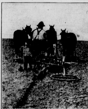
This is our Champion All-Steel Harrow Attachment. There are more of them in use than all other makes combined. Teeth set for any angle instantly by changing draw bolt in circle holes.

The Christiansen Harrow Works 332 Austin St., Winnipeg