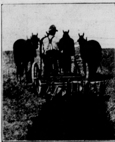
This is a real Packer, not a toy. It has standard wheels, surface or subsurface. It has the weight, but draft reduced by patent dust-proof roller axle.

We have, after years of study, made it possible for you to equip your plows with the most successful of all plow attachments. Thousands of farmers praise them. We help you to increase your yields, and are this season giving every customer on his first order, Campbell's Scientific Farmer for one whole year. We guarantee every shipment to give satisfaction, after a fair trial, or money refunded. Freight prepaid on all orders for two or more.